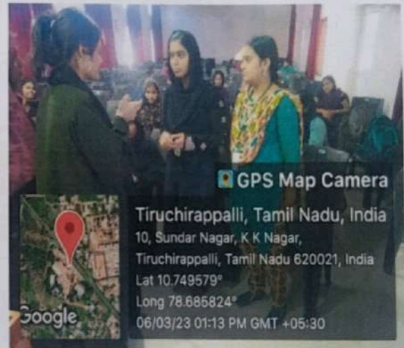
Final round of competition